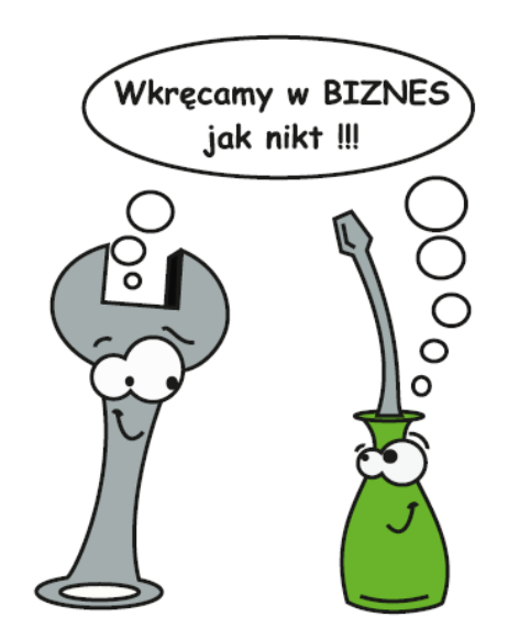
Centrum Praktyk i Karier Studentów i Absolwentów Politechniki Poznańskiej